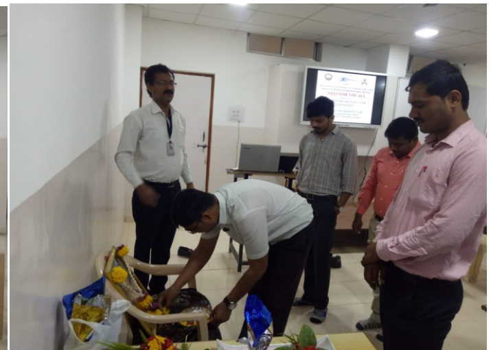
Program is started with Saraswati poojan and Felicitation of Guest